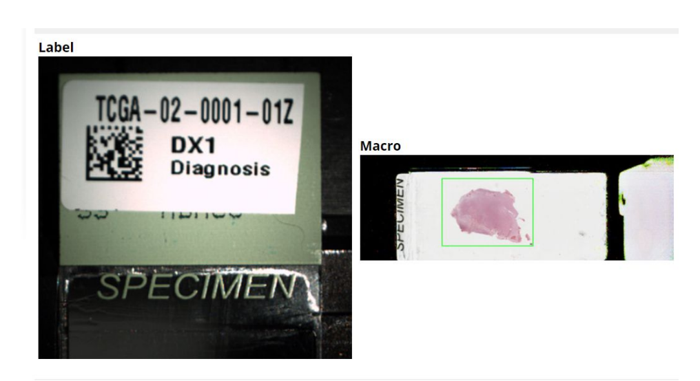
Example Label and Macro WSI Image